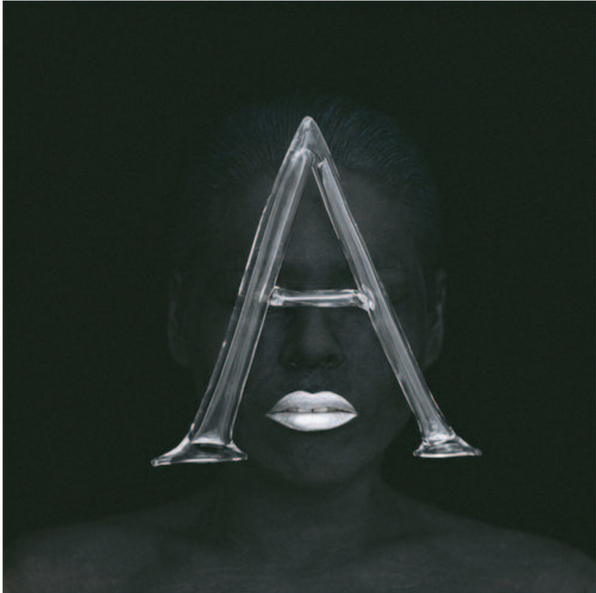
01 Vowel (Black A), Rimbaud Regained. Self-portrait, 2007