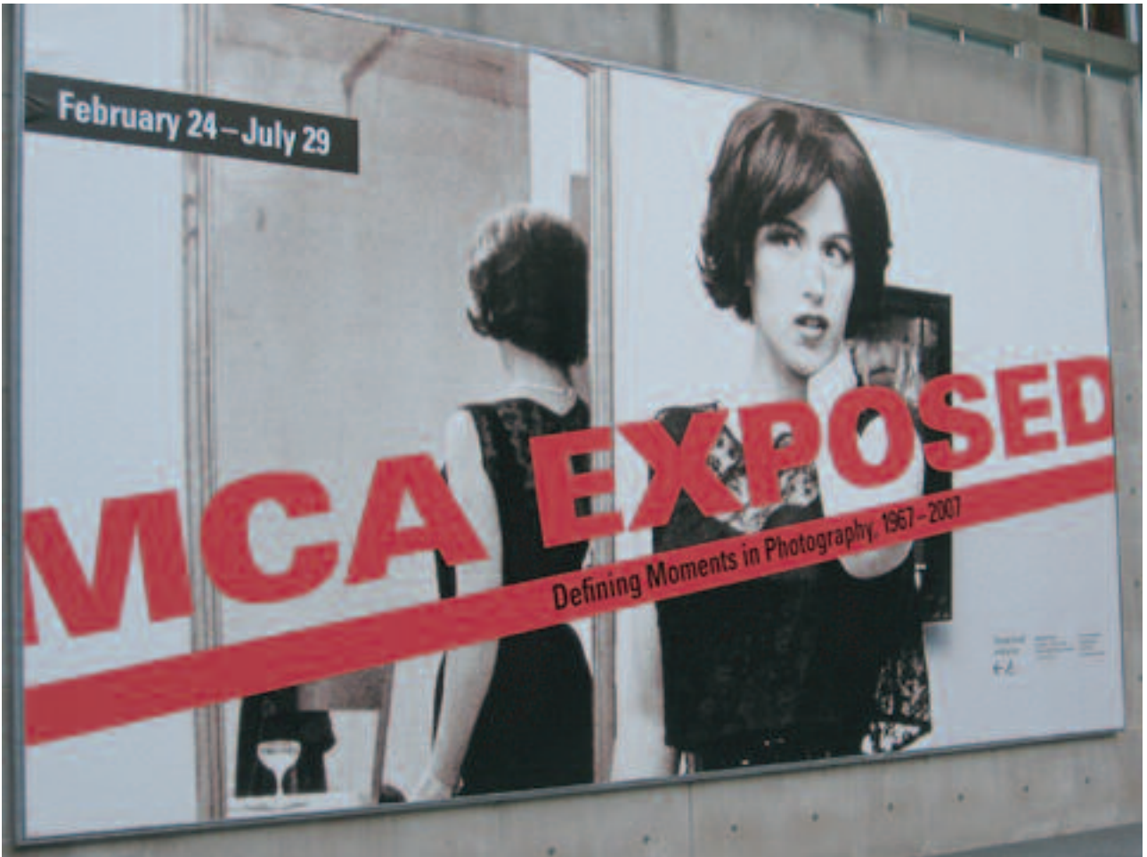
Billboard for photography exhibit at the MCA

I was drawn to the placement of text on the image. The show examined the function of photographs within a larger cultural and social context and how artist explored photography in ways that diverged from its documentary tradition.