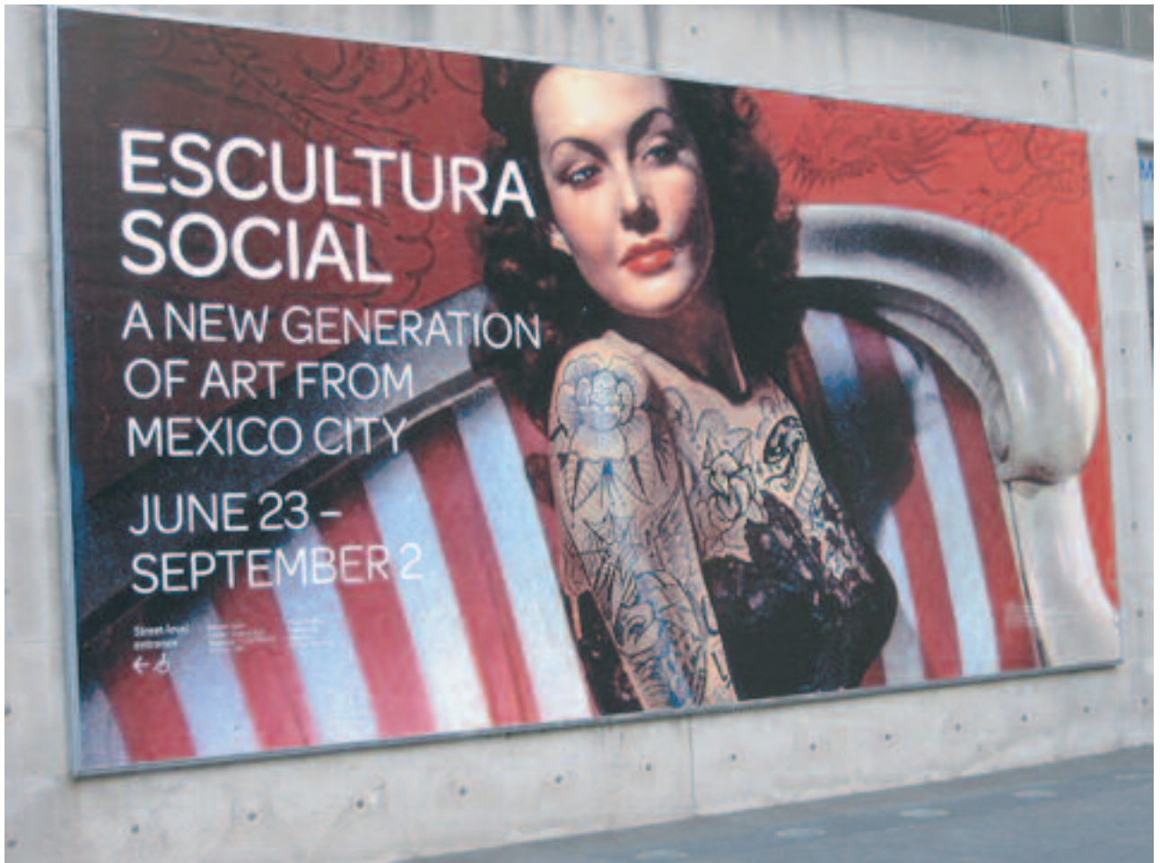
Escultura Social: Billboard for a new generation of art from Mexico city.

I was immediately attracted to the imagery and placement of type on the billboard. The show itself is about a new generation of artist from Mexico city that have developed a new vocabulary that employs non-traditional materials in various mediums. They have re-examined 20th century conceptualism in a fresh way which has been said to make the work unidentifiable as Mexican.