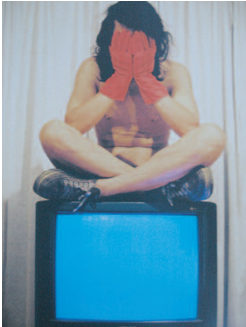
Gao Brothers, TV No.4

Gao Brothers present photography and sculpture which investigates the effects of Chinese urbanization on the spirit.