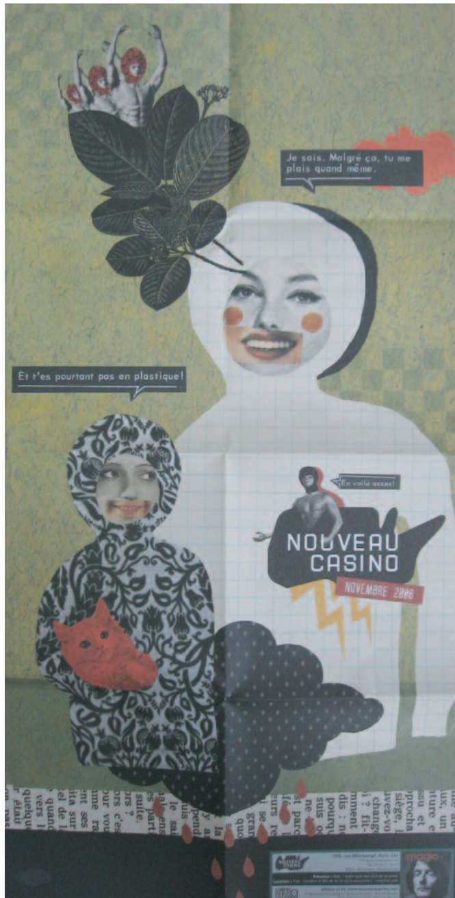
Poster from Paris: I went to Paris in November and picked up this free poster in a book store. I was drawn to it because of the collage aesthetic and how each layer compounded its meaning.