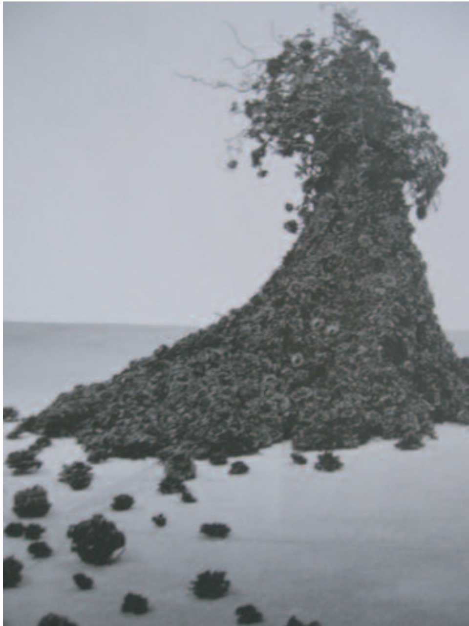
UNTITLED #1103 (Daphne) 2002-2003